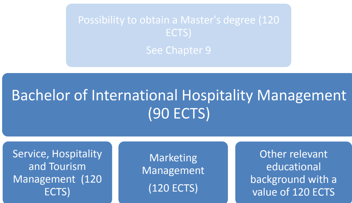
FIGURE 1 The Bachelor of International Hospitality Management programme in the educational system

The following figure (Fig. 1) demonstrates the programme’s position in relation to short-cycle and higher education. A full-time academic year is equivalent to 60 ECTS credits.